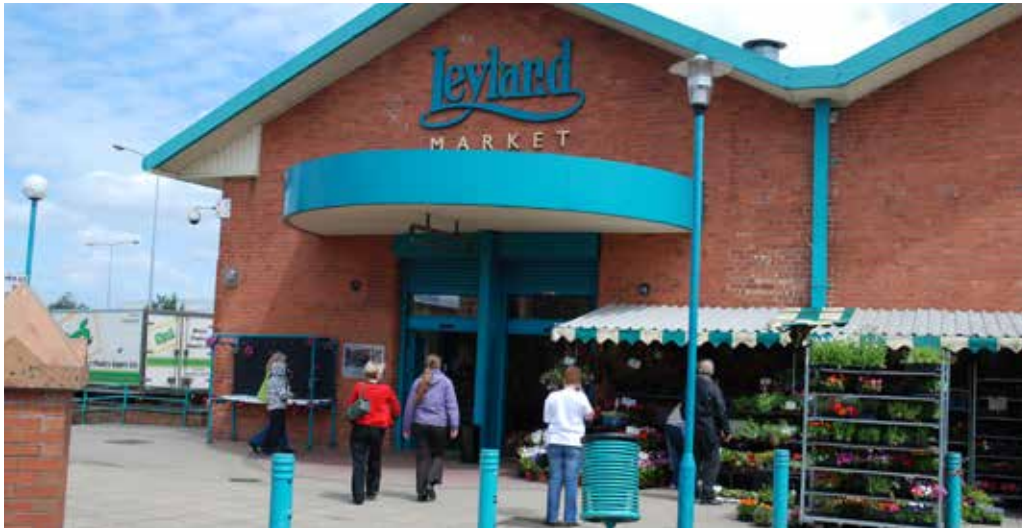
Central Lancashire Local Plan | Preferred Options - Part One Consultation

2.16 There are a number of settlements in South Ribble which include Longton, Higher Walton, Coupe Green and Gregson Lane in South Ribble. Within South Ribble, the settlements of Penwortham, Walton-le-Dale, Bamber Bridge and Lostock Hall (including Tardy Gate) form a fairly continuous urban area on the south side of the River Ribble.